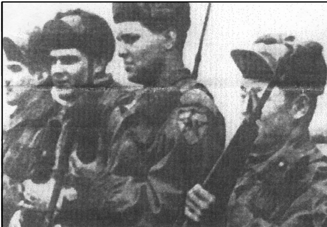
Second Infantry Division Soldiers - including a KATUSA (fourth from left) - prepare to patrol the DMZ.

Some 40 years after the fact, VA has acknowledged that even more veterans were exposed to Agent Orange while serving on Korea's demilitarized zone (DMZ).