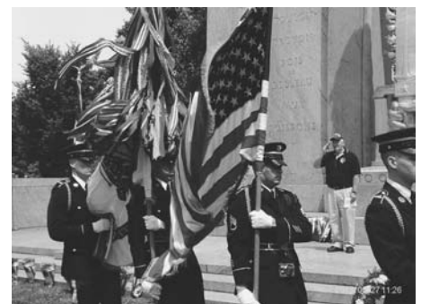
The Old Guard retires the colors.