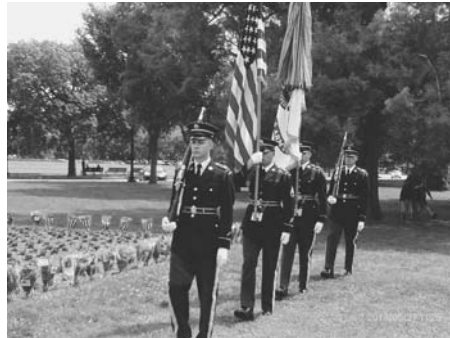
Soldiers from The Old Guard post our National Colors.