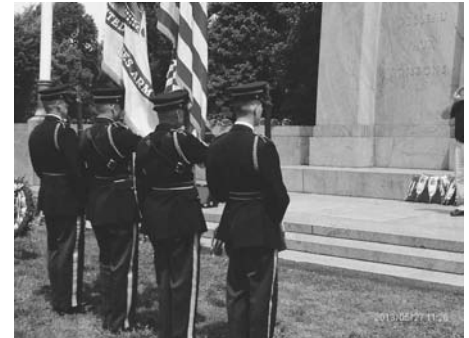
Soldiers from The Old Guard present our National Colors.