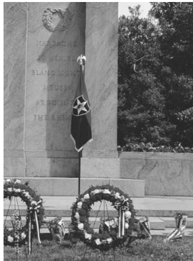
The 2ID Colors.